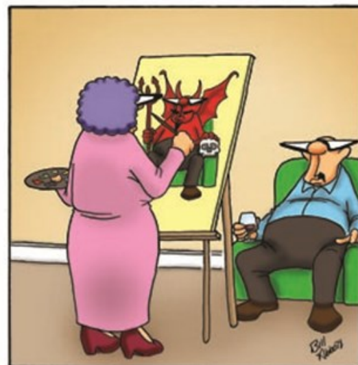
"Still mad at me?"

Art in the schools program will start next fall. All those interested need to take the online program called "Shield the Vulnerable" a very inexpensive web based program, you can use your smart phone. You will get a certificate Connie Gallerizzo will answer any questions.