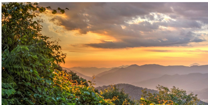
Sunrise on the Blue Ridge Parkway Howard Clark