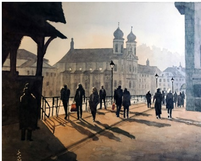
Lucern, Switzerland, Toni Tiu