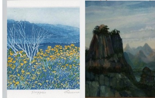
Celebrating her 100TH BIRTHDAY!