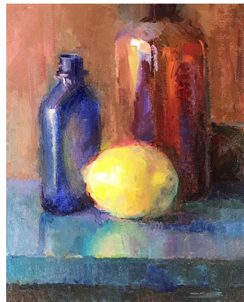
Abigail McBride, Among Friends , Oil on Canvas 10 x 8

plein air or in the studio. Though often free of narrative, her work is grounded in the present day as a contemporary interpretation of genre painting.