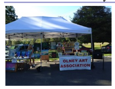
OAA at The Farmer's Market on August 7, 2016