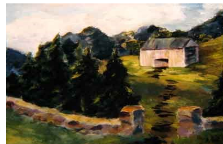
Blue Ridge Barn, Acrylic on Canvas, Penny Kritt

Here's another complicated background. In Blue Ridge Barn below, all the trees are run together in a single shape with just some points at the tops to indicate that they are pine trees. The same is true for the stone walls. Each shape has just enough variation so the viewer can tell what it is. If each tree or stone in the wall was well defined, the composition would just be too busy and confusing. Even though the barn has very little definition, it has enough to make it stand out among the other shapes.