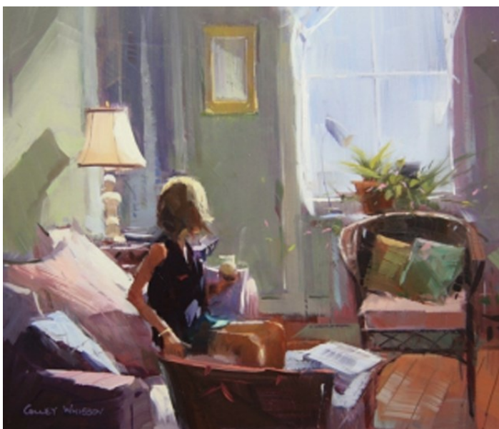
A Time to Relax QLD , Oil, By Colley Whisson (reprinted with permission from the artist)

Look at this lovely painting. It has a wonderful blend of warm and cool colors. The figure is in an interesting pose as she leans slightly forward to see out the window. There are no big value contrasts to make detail obvious, but they are there. Look at the shape of the lamp base at the left margin and the detail underneath the pink cushion on the chair under the window.