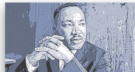
The Voice & Legacy of Harriet Tubman & Martin Luther King Jr.