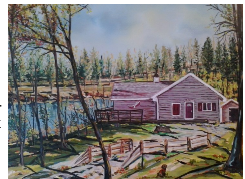
Connie Gallerizzo, Commission, 16 x 20 oil