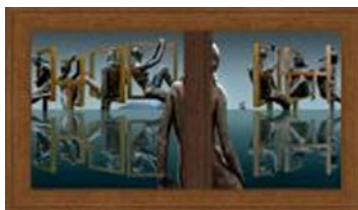
Honorable Mention Waiting for Odysseus Jim Will