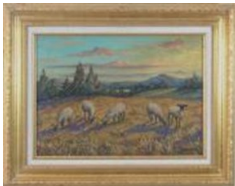
Honorable Mention A few of the Flock Sandra Bourdeaux