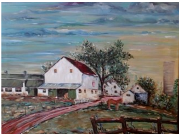
"Down on the Farm"