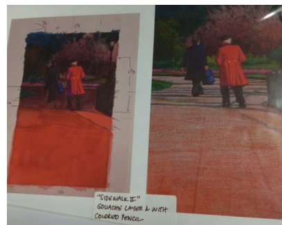
Sidewalk II underpainting and with colored pencil applied