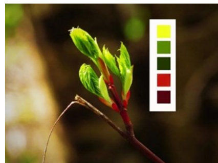
Maple leaf bud (facing left)

In the image above, you eye finds the green first, but now the tight green leaves are "looking" to the left. It slows your eye down, doesn't it? And the reddish stem that fades and disappears into the brown background keeps you closer to the leaves instead of rushing you on to the next painting!