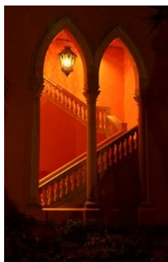
The Staircase, Howard