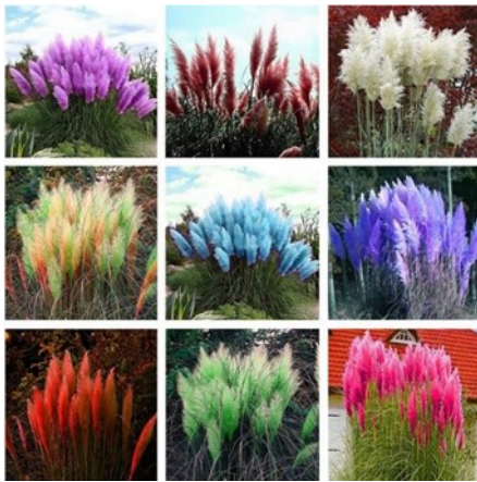
Pampas grass (various varieties)

But, just this once, consider the seeds and leaves that are just sprouting! And not just on flowers. Look at what's happening on ornamental grasses, trees and shrubs. As you look at the images below, notice the wide range of colors you have to work with.