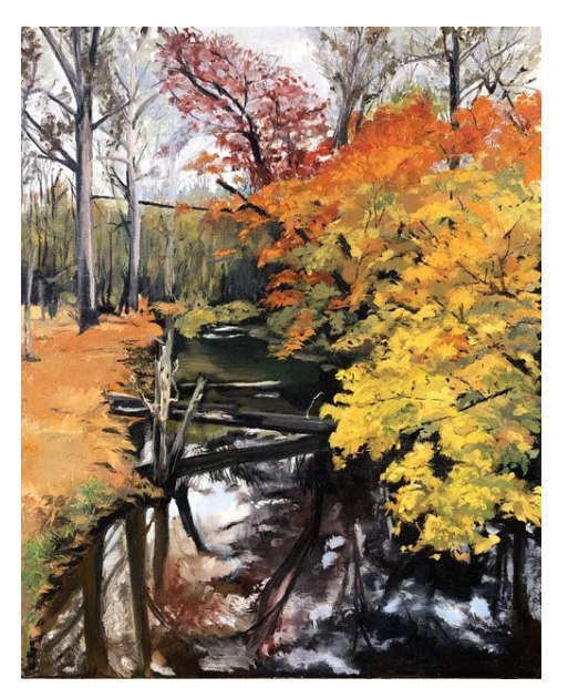
Color along the Creek, oil.