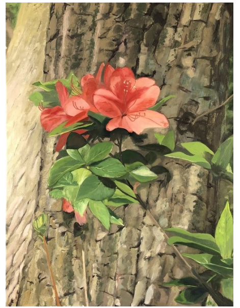
Enduring and Recurring, oil.