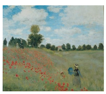
Poppies at Argenteuil by Claude Monet, 1873

November 13 Take Down of the Woodlawn Show