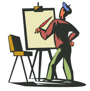
Happy Painting !